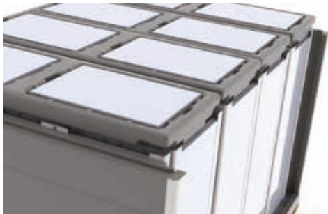
Interlocking high density construction