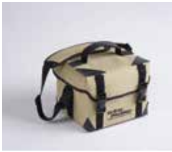
2 LITRES PAYLOAD