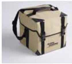
4 LITRES PAYLOAD