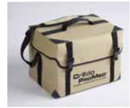
8 LITRES PAYLOAD