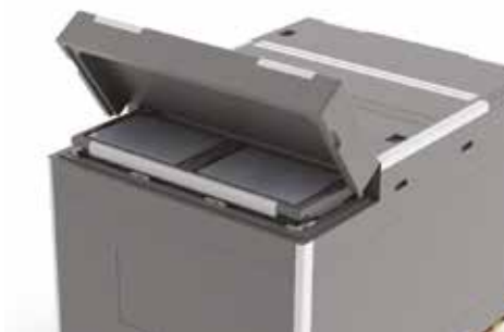
Inspection hatch Minimizing the potential for excursions during customs inspection