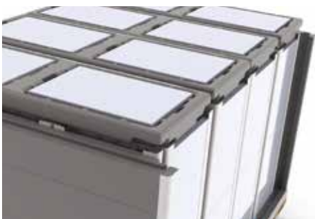
Interlocking high density construction