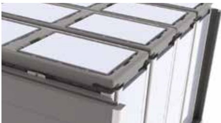
Interlocking high density construction