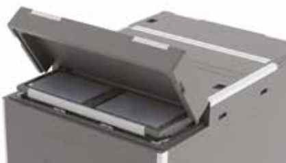
Inspection hatch Minimising the potential for excursions during customs inspection