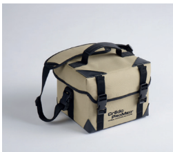
2 LITRES PAYLOAD