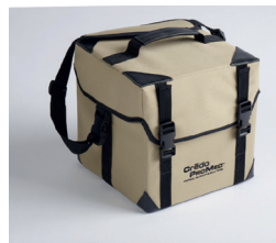
4 LITRES PAYLOAD