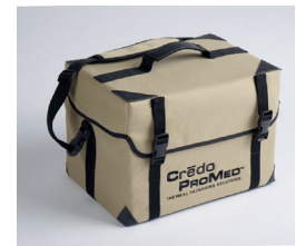
8 LITRES PAYLOAD